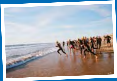
The 25th Annual Make-A-Wish Triathlon at Sea Colony, Hosted by Sea Colony Resort in Bethany Beach, Delaware

In fiscal year 2009, the Make-A-Wish Foundation of the Mid-Atlantic produced five extraordinary events to raise funds and awareness. The following events offered a tangible way for members of the community to support the Foundation's mission. A special thanks to all of the sponsors, participants and volunteers who made each of these events a great success!