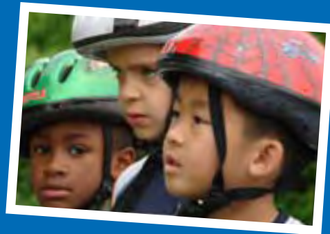
The 19th Annual Make-A-Wish Kids' Triathlon